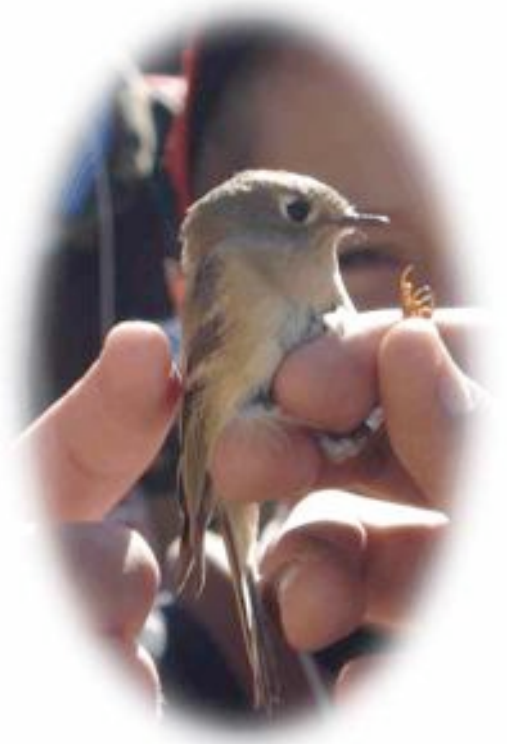
Newly Banded Ruby-crowned Kinglet

and Tom Wyant confirmed what I'd suspected--mating. The evidence is their tails being latched together just at the base of the black-and-white bands that precede the rattles.