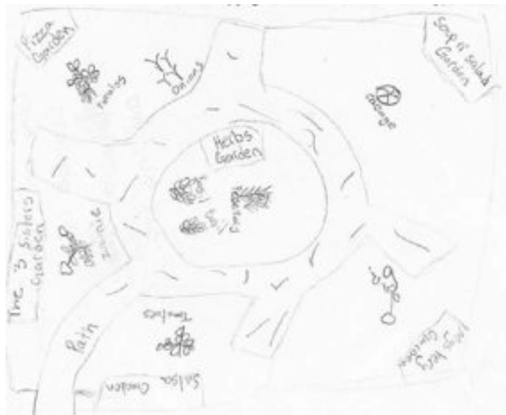
K-Club Garden Map By Ciara Carter (5 th grade)

In K-Club I learned about many things that can harm plants and also things that are helpful for the environment. The harmful things are about certain types