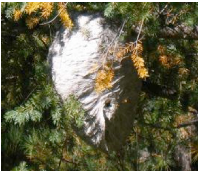
The mystery nest with the entry hole clearly visible.