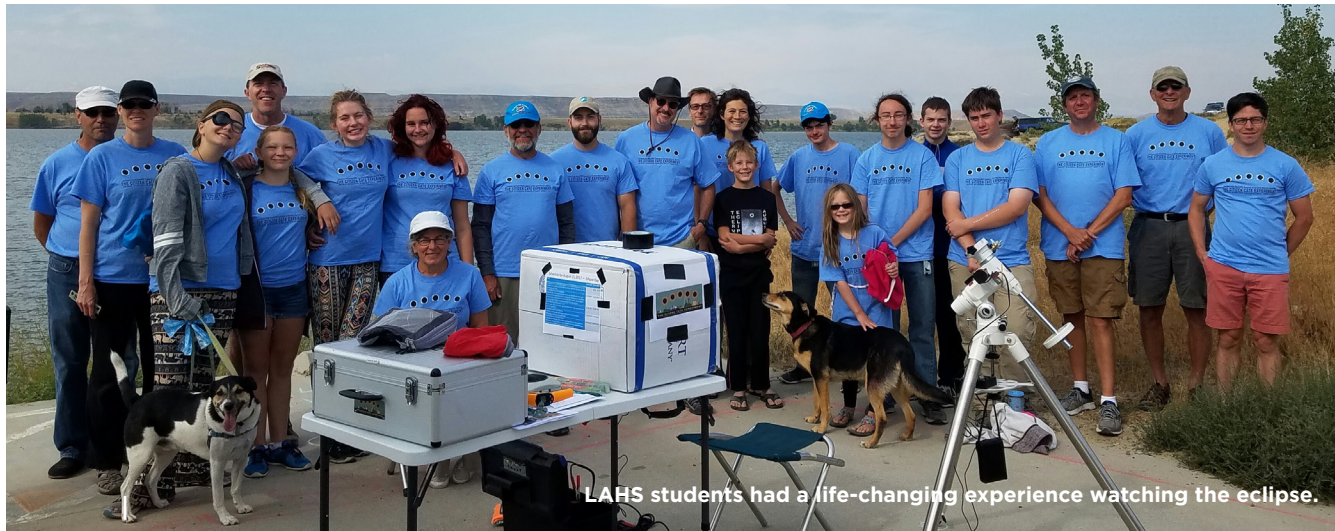
LAHS students had a life-changing experience watching the eclipse.