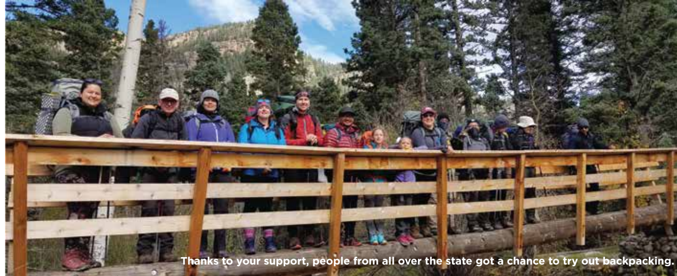
Thanks to your support, people from all over the state got a chance to try out backpacking.